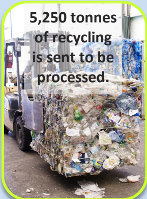
5,250 tonnes of recycling is sent to be processed.

22,400 tonnes of garbage went to the landfill. That's ~3.5x18 wheeler truckloads daily.