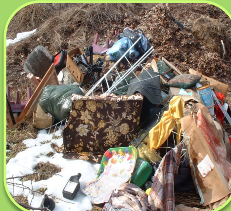
The Cost of Waste Management 2019/2020

140 reported cases of illegal dumping were investigated.