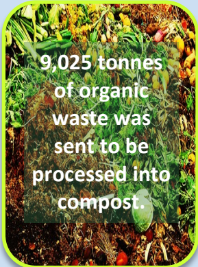
9,025 tonnes of organic waste was sent to be processed into compost.