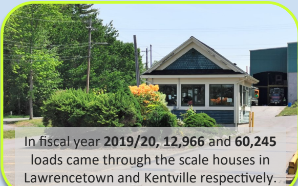
In fiscal year 2019/20 , 12,966 and 60,245 loads came through the scale houses in Lawrencetown and Kentville respectively.

Valley Waste Resource Management services 32,500 dwelling units across Kings and Annapolis Counties. Curbside Collection happens at an estimated 4,000 dwelling units daily.