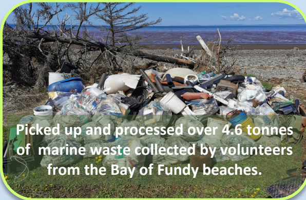
Picked up and processed over 4.6 tonnes of marine waste collected by volunteers from the Bay of Fundy beaches.

A transfer station is a building or processing site for the temporary consolidation of waste. Everything that is brought to the transfer station is sent to be processed elsewhere—garbage to the landfill, recycling to Scotia Recycling, organics to Fundy Compost Inc. Items such as paint, Household Hazardous Waste (HHW), oil, batteries and electronics are managed in partnership with other recycling programs. Valley Waste has two transfer stations each based in Kentville and Lawrencetown.