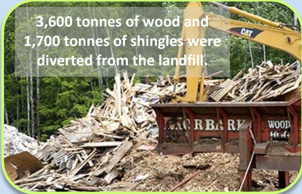
3,600 tonnes of wood and 1,700 tonnes of shingles were diverted from the landfill.

22,400 tonnes of garbage went to the landfill. That's ~3.5x18 wheeler truckloads daily.