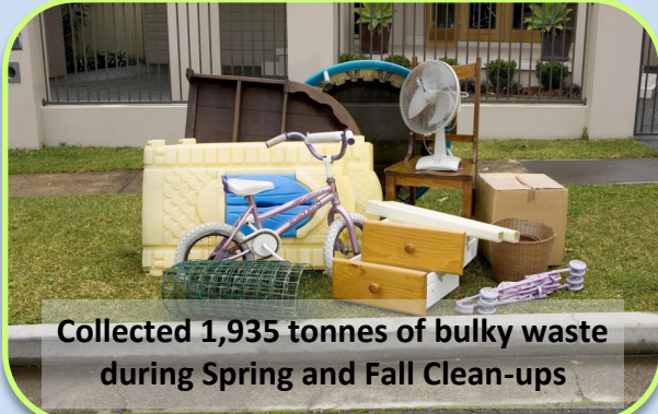
Collected 1,935 tonnes of bulky waste during Spring and Fall Clean-ups

~ 5,000 small (5lb) and 747 large propane cylinders were brought into transfer stations for recycling.