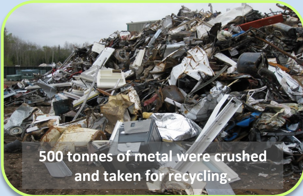
500 tonnes of metal were crushed and taken for recycling.