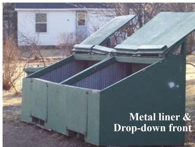
Metal liner & Drop-down front